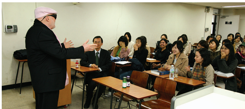
FIGURE 2: KC lecturing at Ewha Womans University, Seoul, Korea, in 2006.