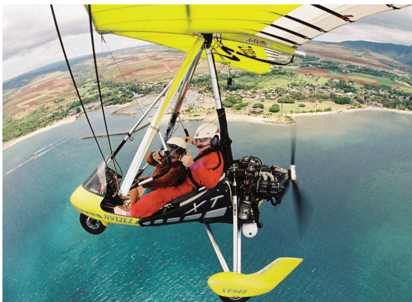
FIGURE 6: Striving upward: KC in a powered hang glider over Oahu.